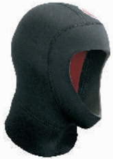
Standard neoprene hood no. 1011x