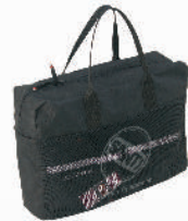
Undersuit Bag no. 1080