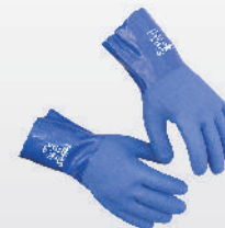
Summer dry gloves no. 1051x