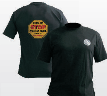
Divers tees Version D