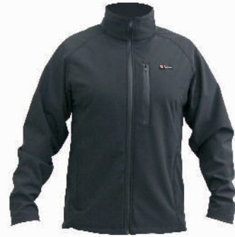
Classic SOFTSHELL Jacket