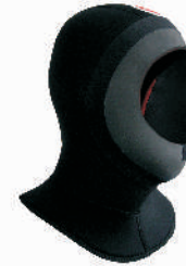
Collar neoprene hood for full face mask no. 1015x