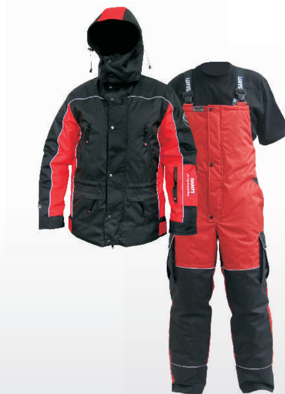
EXPEDITION Jacket, EXPEDITION Trousers