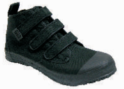
Rockboots no. 1023x