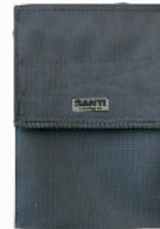
Enduro pocket no. 1040