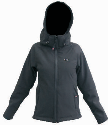
Ladies HOODED SOFTSHELL Jacket