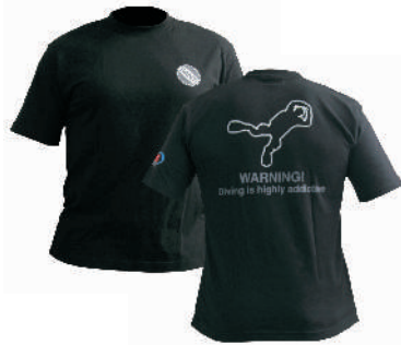
Divers tees Version A