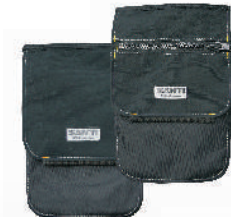
E.LITE pocket no. 1044