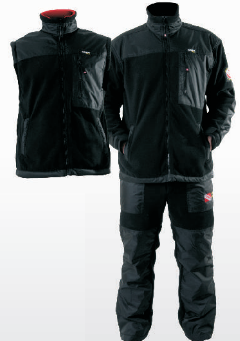
Fleece Jacket, Fleece Trousers Fleece Body Warmer