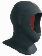
Collar neoprene hood no. 1014x