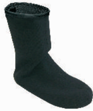
Neoprene sock no. 1021x