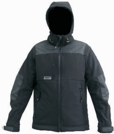
Men's HOODED SOFTSHELL Jacket