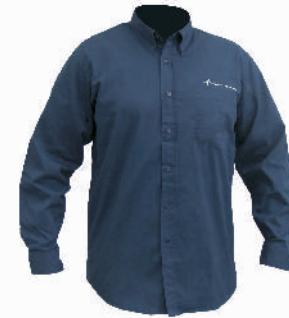
Long sleeve casual shirt