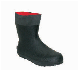
Standard neoprene boots no. 1020x