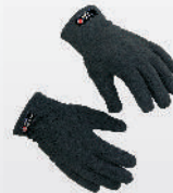
Polar lining for dry gloves no. 1053x