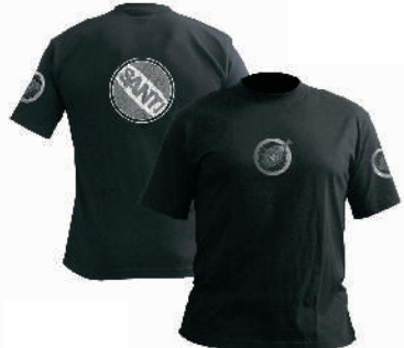
Divers tees Version B