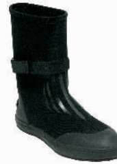
Flex Soles no. 1022x