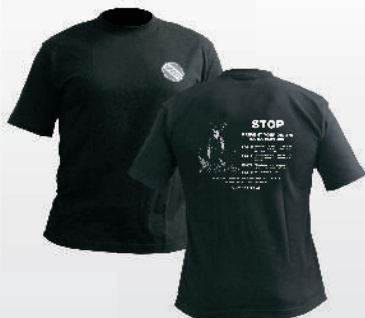
Divers tees Version C