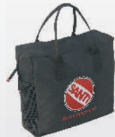
Leisure Bag no. 1084