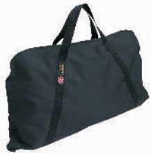
Drysuit Bag no. 1081