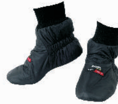
Nylon Socks no. 1090x