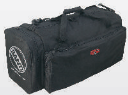
E.Lite Bag no. 1082