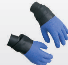
Dry gloves with wrist seals no. 1052x