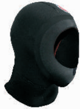
Standard neoprene hood for full face mask no. 1013x