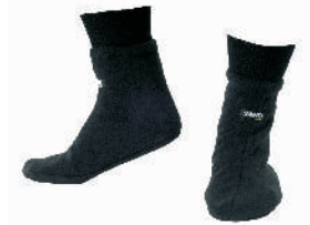
Polar socks no. 1091x