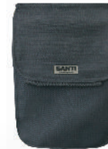
SPACE pocket no.1040