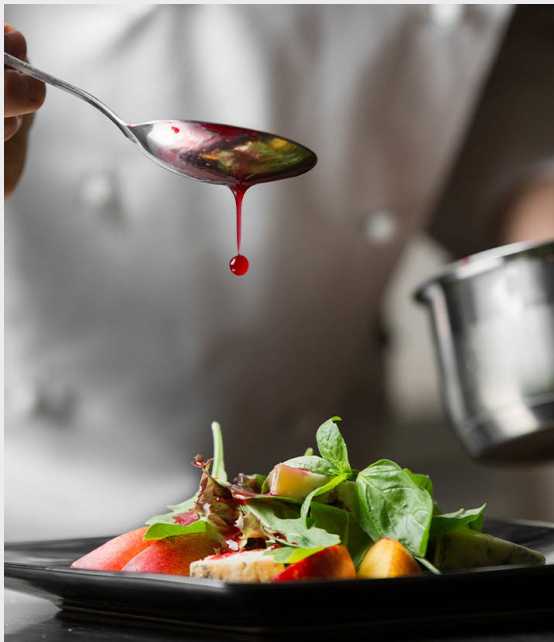
CELEBRITY CHEF ON BOARD