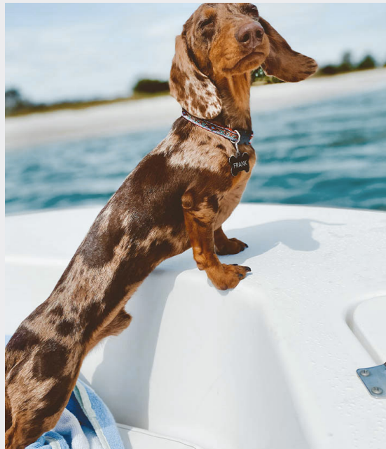
PET FRIENDLY WEEK